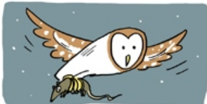
-The Barn Owl

MOULT INTO THE SAME DAZZLING ETHNIC SUIT FROM LAST YEAR!