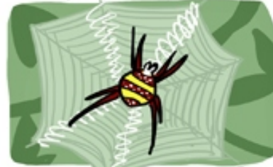
-The Signature Spider