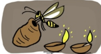
-The Potter Wasp