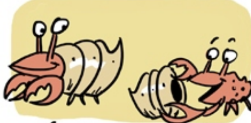
-The Hermit Crab