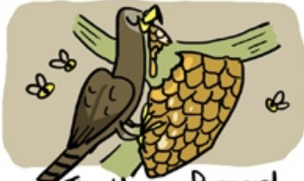
-The Honey Buzzard