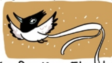
-The Paradise Flycatcher

MOULT INTO THE SAME DAZZLING ETHNIC SUIT FROM LAST YEAR!