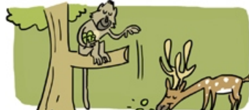
-The Grey Langur